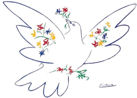
Dove of Peace by Pablo Picasso